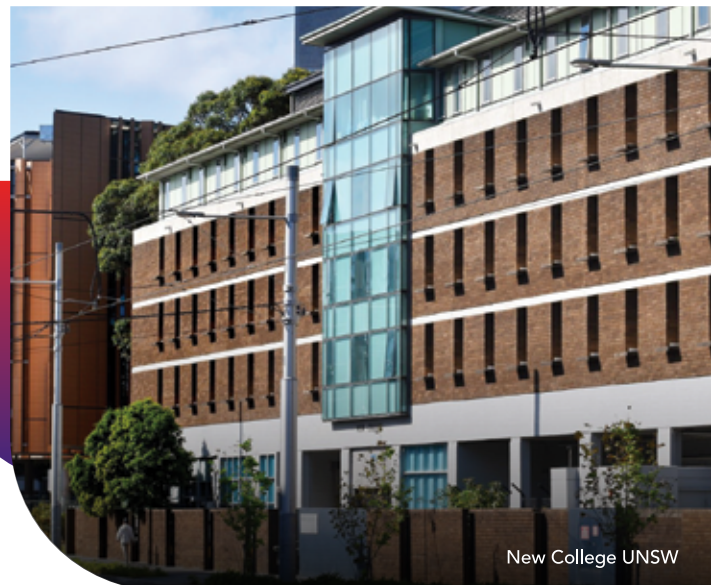
New College UNSW

Our unique platform, high-quality service and exceptional customer support set us apart from our competitors, making us the preferred choice for managed Wi-Fi solutions.